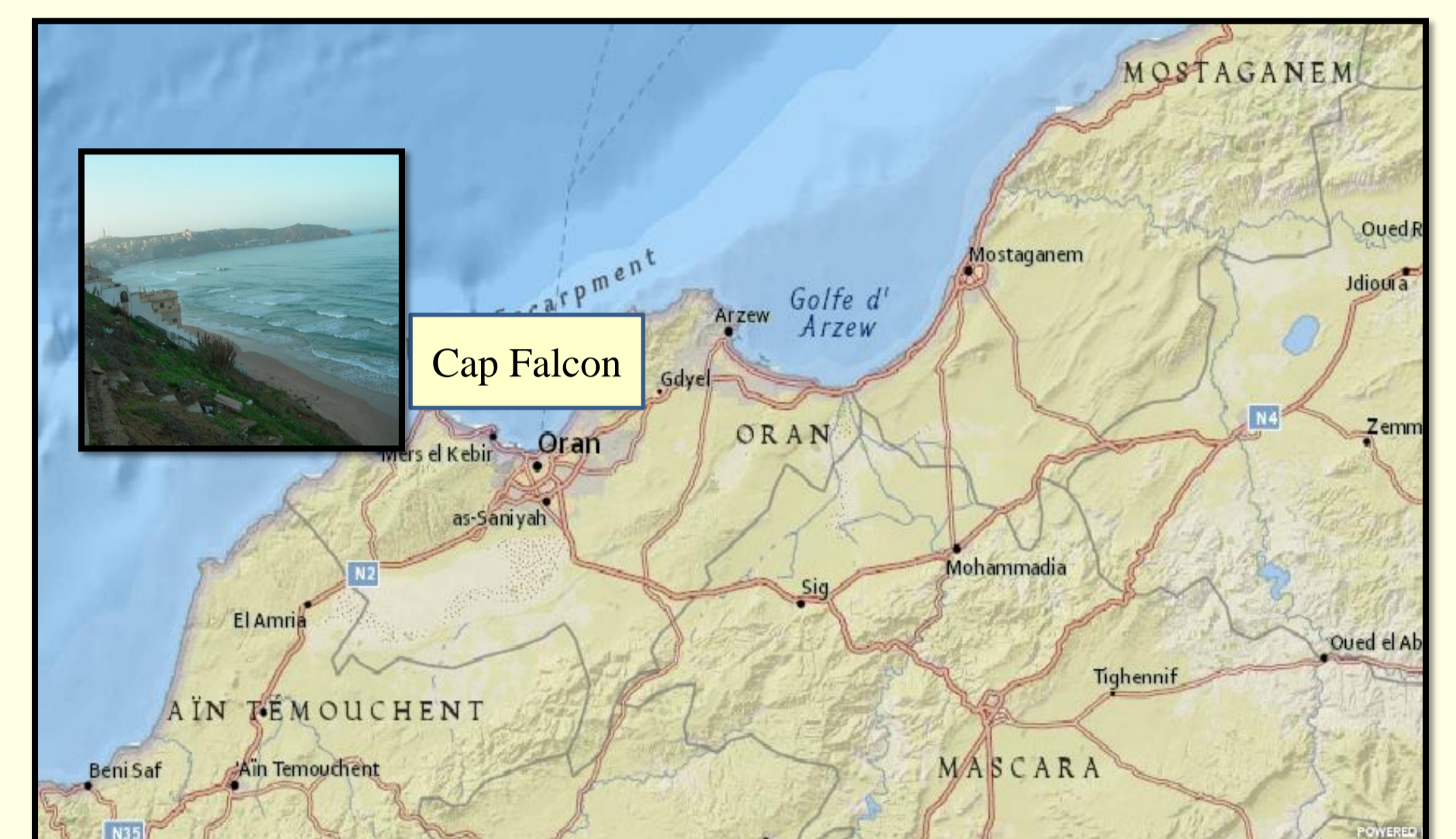
Sampling site: Cap Falcon

❖ Maximum likelihood phylogeny was conducted using RAxML version 8 using all concatenated photosystem I and II genes for the diatoms whose chloroplastic genome was available.